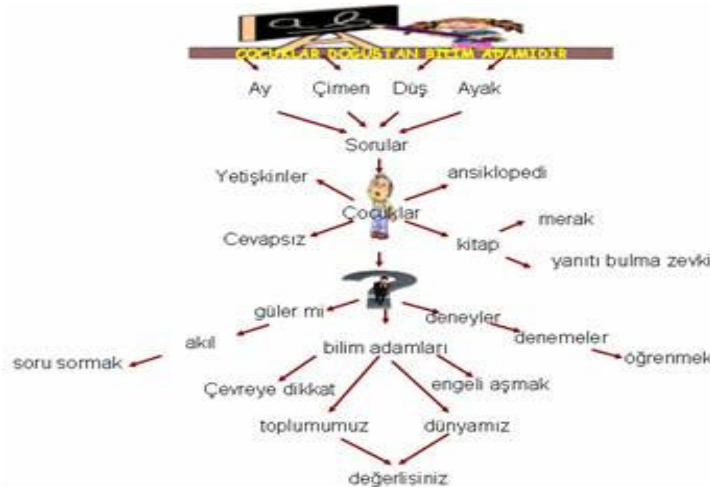
Figure 1. The Last Page of the Concept Map Created for the Listening Text

Concepts maps contained keywords derived from the context of the listening text as well as few visuals, as can be seen in Figure 1. The students watched the concept map that is encountered with the read text and tried to trace the map in their conscious as a schema.